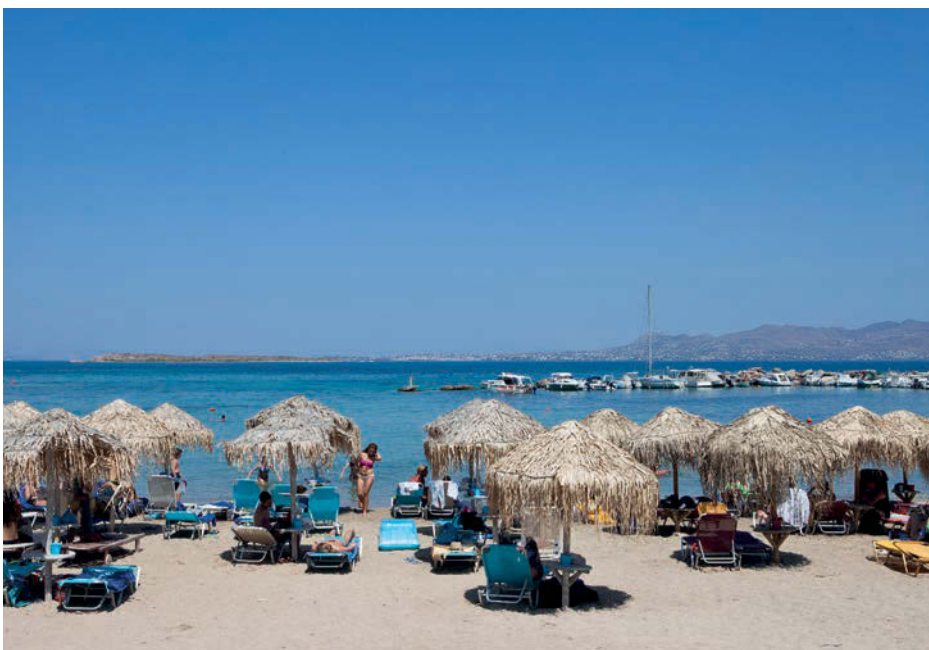
Beach in front of Oasis Scala Hotel