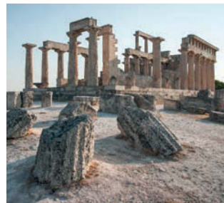
Temple of Aphaia

A highly recommended and most comfortable base from which to explore Aegina, or to simply recharge batteries in glorious, peaceful surroundings.