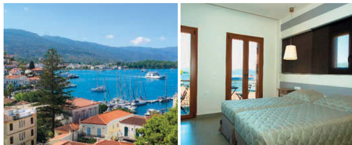
View from roof terrace